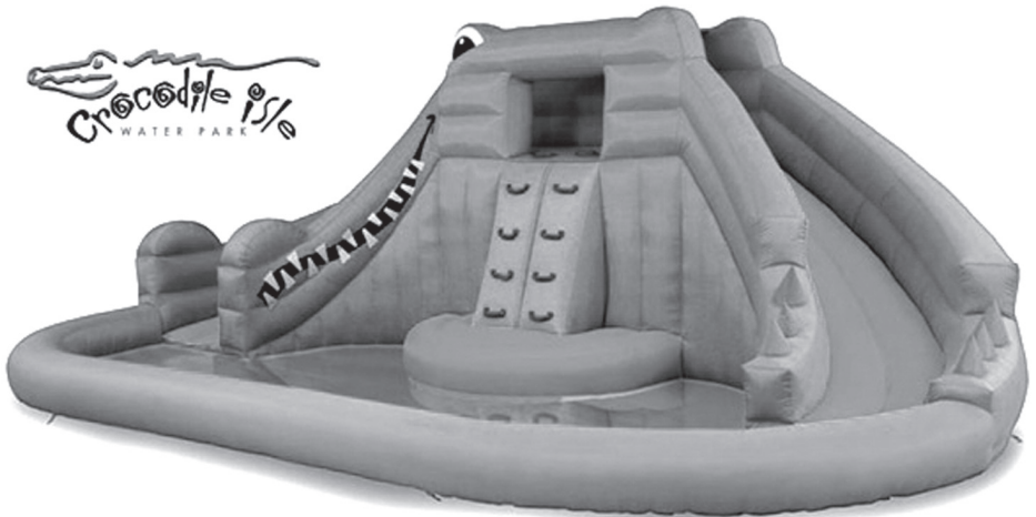
CROCODILE ISLE™ by Blast Zone®

Vortex International Enterprises or any of its subsidiaries may not be held liable for any breach of contract, fiduciary duty, negligence, negligent design, negligent manufacturing, failure to warn for defects in design, materials or workmanship, under any statute, consumer protection legislation, or any regulations passed there under, or for absolutely any other potential cause of action or absolutely any other basis upon which liability may otherwise be found, is strictly limited, without exception, to repair or replacement of the product, at our sole discretion. In no way shall Vortex be responsible for incidental, consequential, resultant or contingent damages of absolutely any type, whatsoever, whether these damages were caused or incurred by our breach of contract or negligence or by any other cause whatsoever. If any part of this warranty, exclusion, disclaimer and limitation of liability clause is determined to be invalid or unenforceable in whole or in part, such invalidity or unenforceable provision will attach only to such provision or part thereof and the remaining part of such provision and all other provision will continue in full force and effect. Vortex reserves the right to change or modify this product within reason without notice, and without obligation to modify existing products.